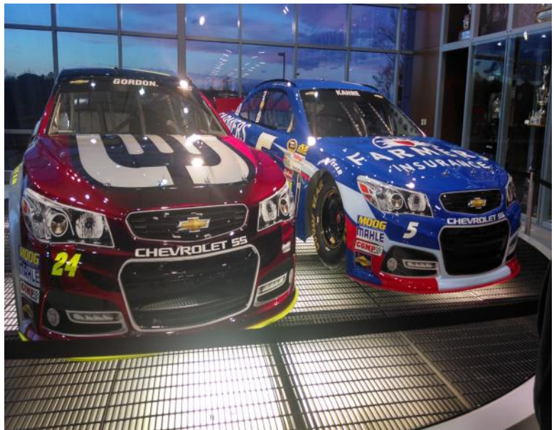
Pictured here the #24 Jeff Gordon car and the #5 Kasey Kahne car.