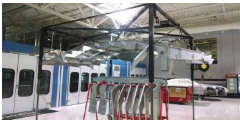
This is a measuring apparatus for the car frames.

I had a chance to get a private tour of the Hendrick “garage” as they call it. I can assure you, it is not even