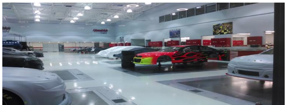
I was only allowed to take pictures in this room from afar although I was able to get up close and personal anywhere that I wanted. The painted body seen above you will also see at Daytona in February. Jeff Gordon will be inside of it.